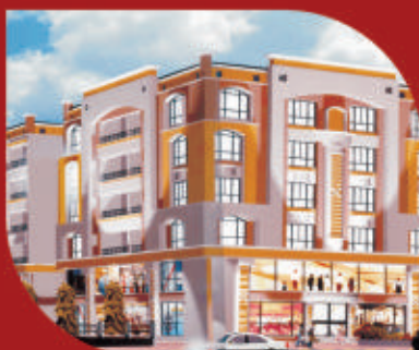
Natural Park View, Kolkata