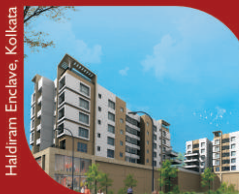
Haldiram Enclave, Kolkata