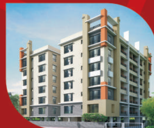
Natural Heights (Ph-II)