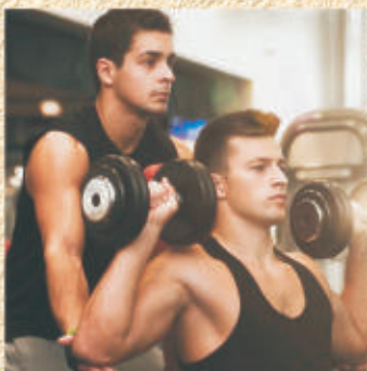
Gym & Health Club