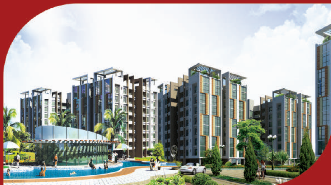
Natural City, Bardhaman