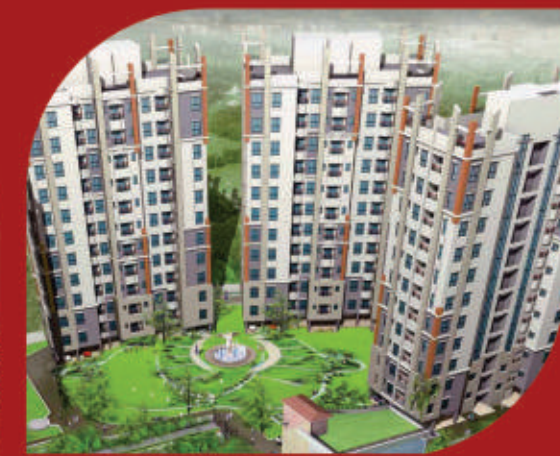
Natural Heights, Durgapur