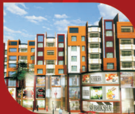
Natural Enclave, Kolkata