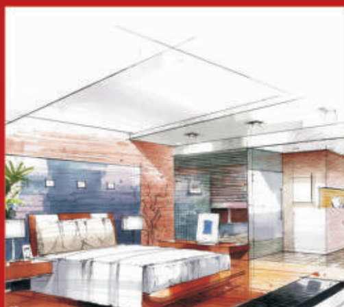
LUXURY HOMES WITH TERRACE

“ INTRODUCING ONE LAKH TWENTY THOUSAND SQUARE FT. OF UTILITY, LUXURY, AND CONVENIENCE ”