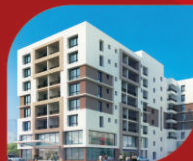
Natural Sarvapriya, Kolkata