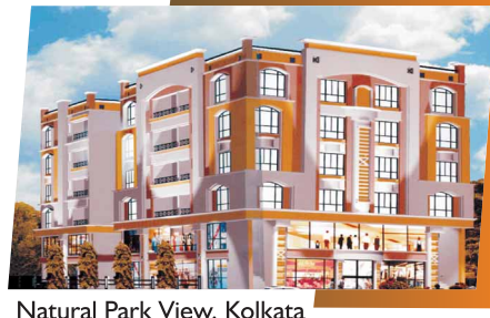
Natural Park View, Kolkata