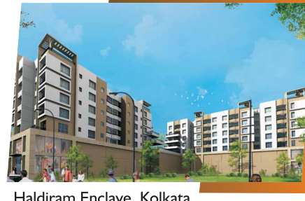
Haldiram Enclave, Kolkata