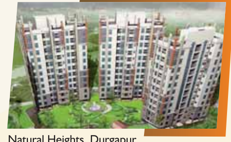
Natural Heights, Durgapur