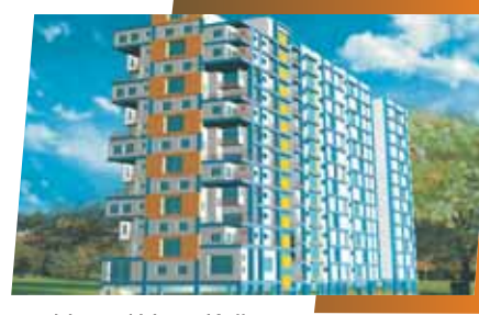
Natural View, Kolkata