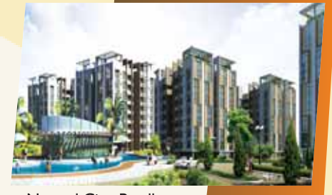
Natural City, Bardhaman