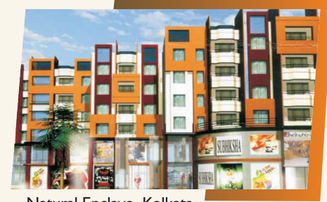
Natural Enclave, Kolkata