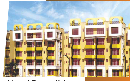
Natural Greens, Kolkata