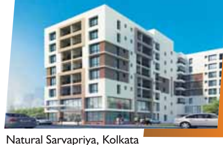
Natural Sarvapriya, Kolkata