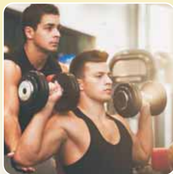
Gym & Health Club