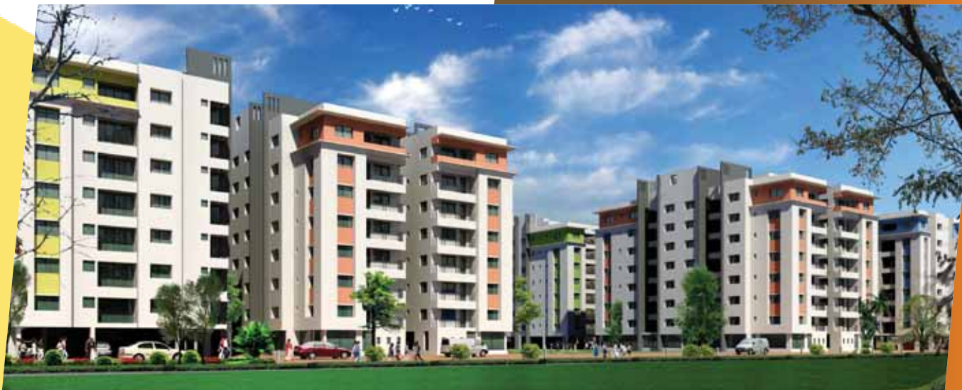
Natural City, Shyamnagar Rd, Kolkata