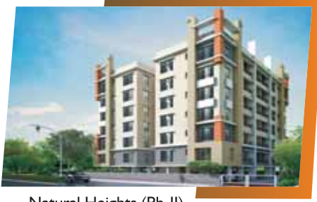
Natural Heights (Ph-II)