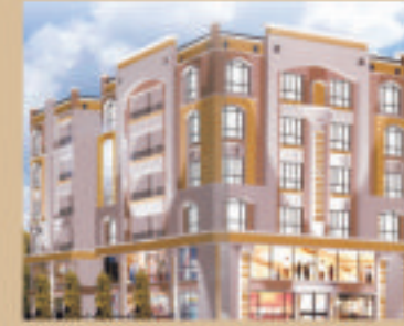
Natural Park View, Kolkata