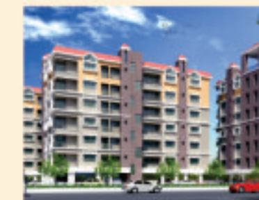
Natural Awas, New Township Rd. Kol.