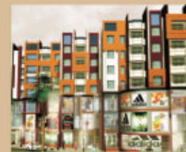
Natural Enclave, Kolkata