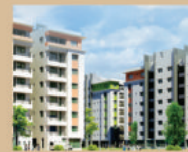
Natural City, Kolkata