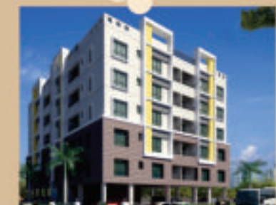
Natural Harmony, Howrah