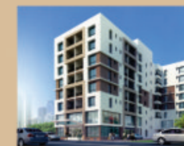
Natural Sarvapriya, Rashbehari Avenue, Kol