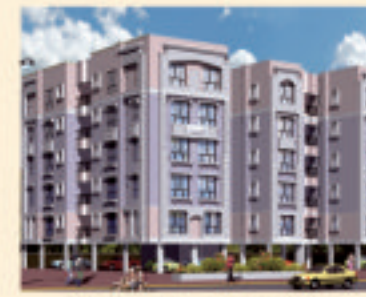
Natural Nest, Kolkata