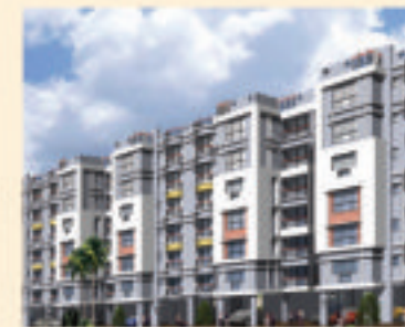
Natural Residency, Kolkata