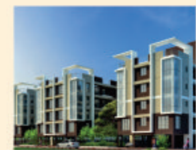
Natural Niketan, Sodepur, Madhyamgram