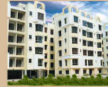
Natural Greens, Kolkata