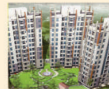
Natural Heights, Durgapur