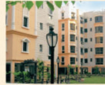
Natural Heights, Kolkata

It includes Natural Awas, Chinar Park, Kolkata; Natural Harmony, Salkia, Howrah; Natural Niketan, Sodepur, Madhyamgram; Natural Sarvapriya, Rashbehari Avenue, Kolkata; Natural Paradise, near Ruby Hospital, Kolkata; Natural Residency II, Golaghata, VIP Rd, Kolkata; Natural Heights II & III, Durgapur & many more in the offing.