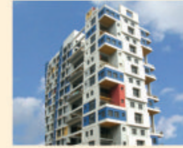
Natural View, Kolkata